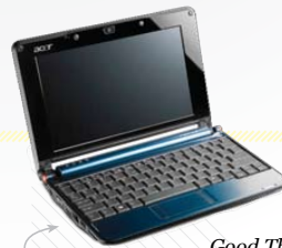
NOT ACTUAL SIZE