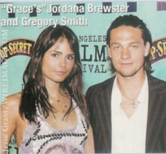
"Grace's" Jordana Brewster and Gregory Smith

A constellation of stars — including William H. Macy, Helen Hunt, Jake Gyllenhaal, Mike Myers, Andrew, Owen and Luke Wilson and surfing legends Laird Hamilton and Dave Kalama — were honored during the Maui Film Festival , which ran Wednesday through Sunday.