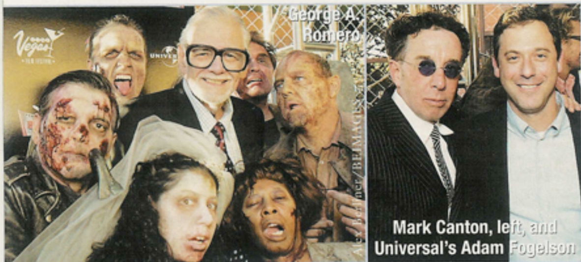
George A. Romero