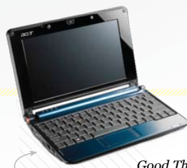
NOT ACTUAL SIZE