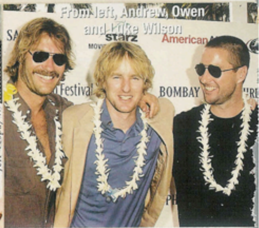
From left, Andrew, Owen and Luke Wilson