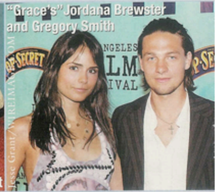
"Grace's" Jordana Brewster and Gregory Smith

A constellation of stars — including William H. Macy, Helen Hunt, Jake Gyllenhaal, Mike Myers, Andrew, Owen and Luke Wilson and surfing legends Laird Hamilton and Dave Kalama — were honored during the Maui Film Festival , which ran Wednesday through Sunday.